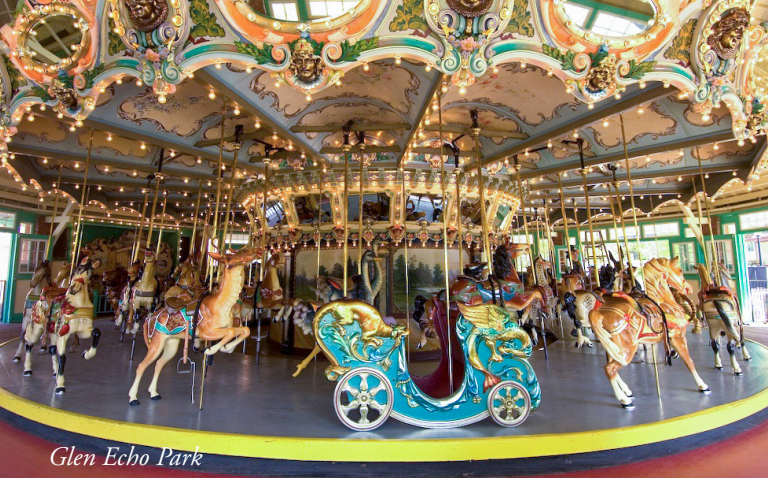
Glen Echo Park